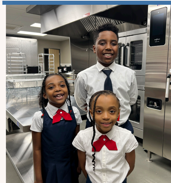
Scholars in the newly renovated kitchen

These rising 5th grade scholars are excited for their new classrooms! The final construction plans at the Burleigh Street Campus include completing the middle school on the 3 rd floor, which will eventually serve 300 scholars.