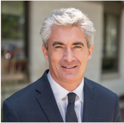
Center Street Campus (CSC).

Over the past decade, the campus has expanded to serve a total of 350 students, all of our 3-year-old scholars were relocated to Center Street, and the campus has now graduated three cohorts of 8th-grade classes. In short, CSC is thriving!